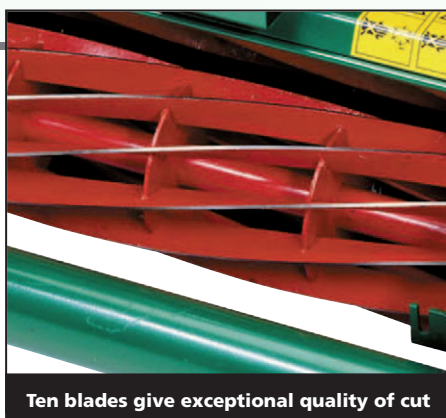
Ten blades give exceptional quality of cut

The smooth front roller is manufactured from steel for improved durability. Like the Super Certes there are optional Verti-Groom and brush and comb sets available to further enhance the quality of cut.